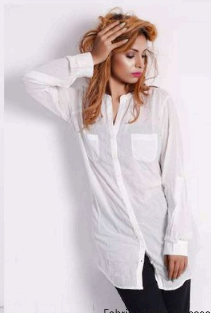
Fabric : 100% Viscose Solid 60 X 60 / 90 X 88 85 GSM