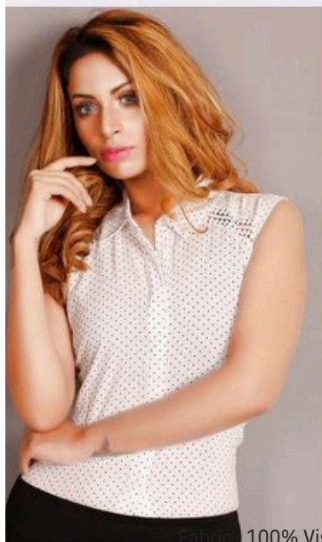
Fabric : 100% Viscose 60 X 60 / 90 X 68 85 GSM