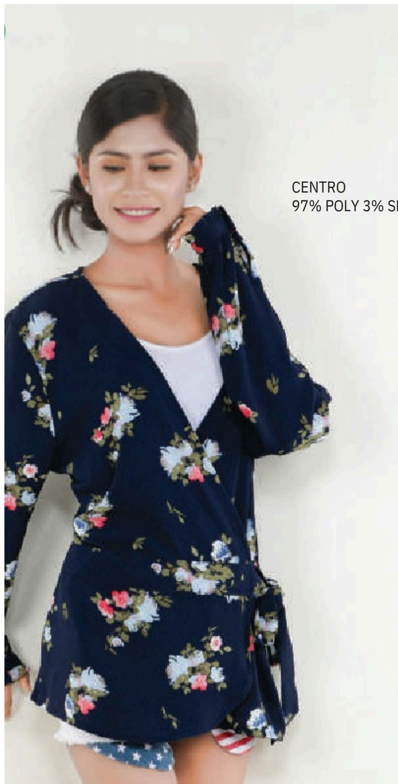
CENTRO 97% POLY 3% SPANDEX