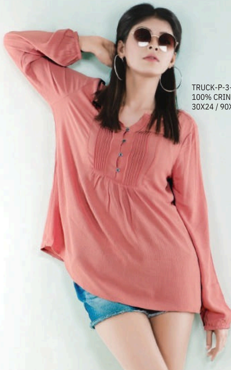
TRUCK-P-3-YD 100% CRINKLE VISCOSE 30X24 / 90X44