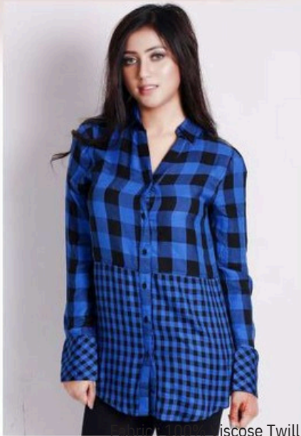
Fabric : 100% Viscose Twill Y/D 30 X 30 / 90 X 68 130 GSM