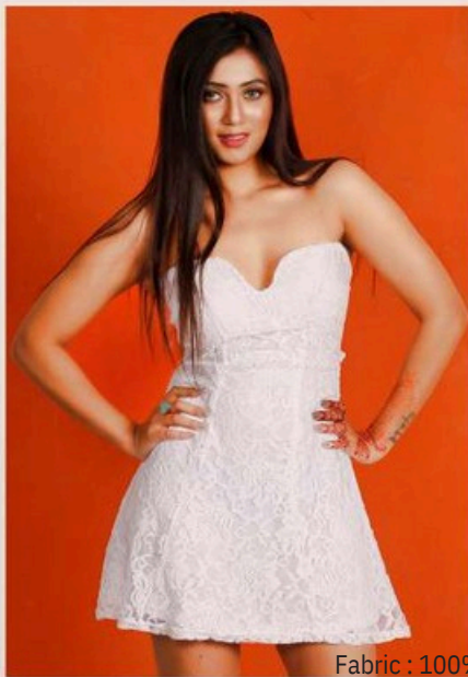
Fabric : 100% Polyester Lace - D 120 GSM