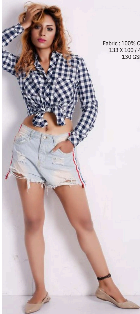
Fabric : 100% Cotton Y/D 133 X 100 / 40 X 40 130 GSM