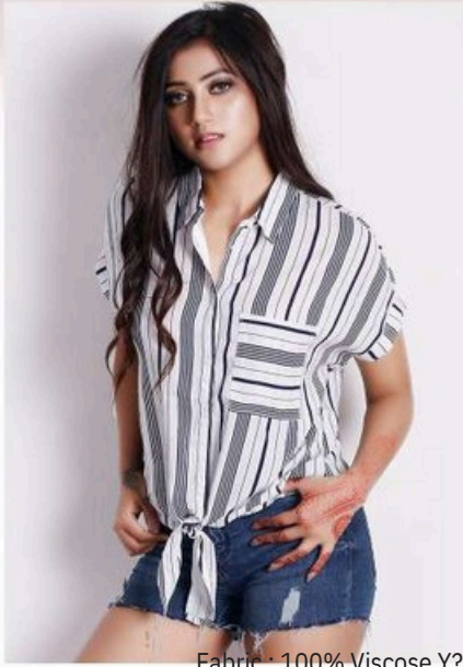
Fabric : 100% Viscose Y?D 40 X 40 / 110 X 80 125 GSM