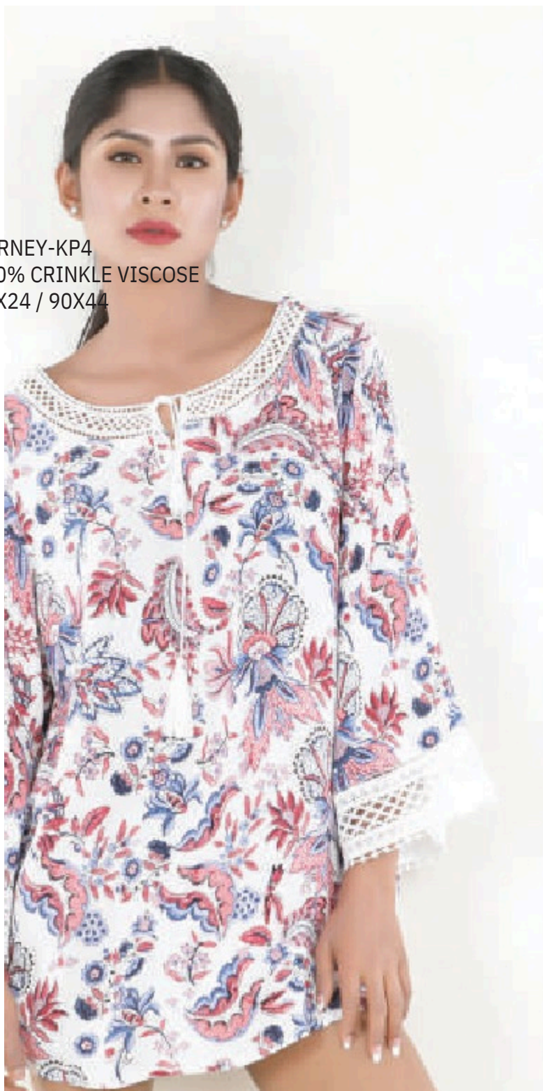
BARNEY-KP4 100% CRINKLE VISCOSE 30X24 / 90X44