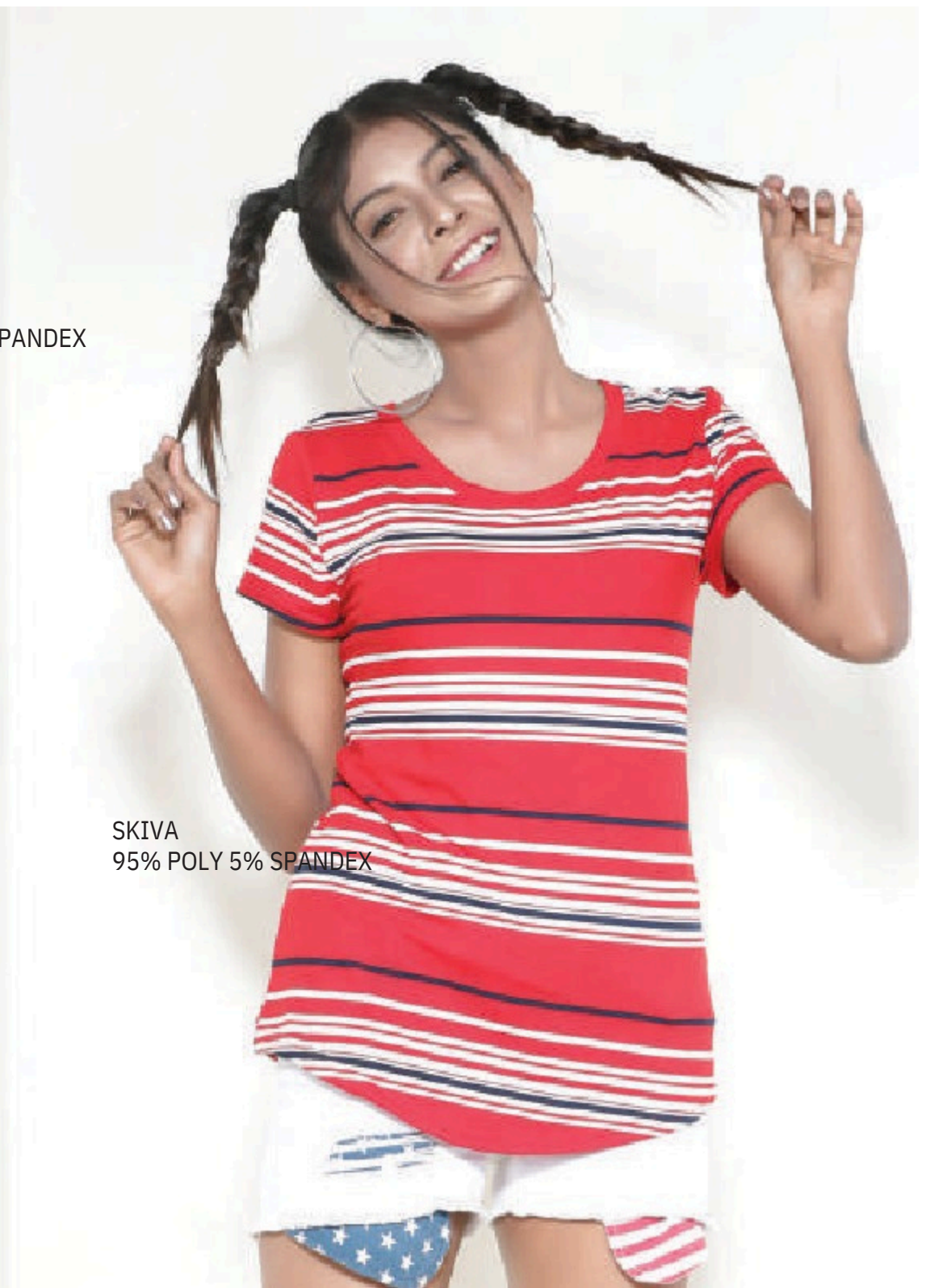
SKIVA 95% POLY 5% SPANDEX