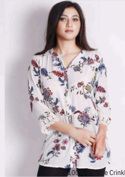
Fabric : 100% Viscose Crinkle 30 X 24 / 68 X 41 135 GSM