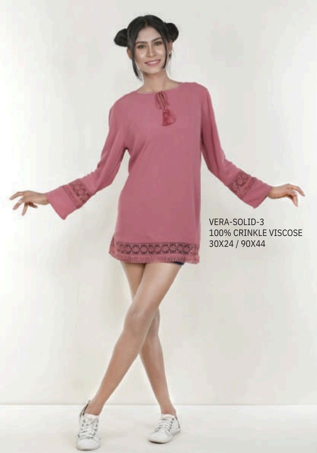
VERA-SOLID-3 100% CRINKLE VISCOSE 30X24 / 90X44