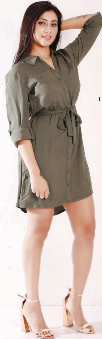
Fabric : 100% Viscose Twill 30 X 30 / 68 X 68 120 GSM