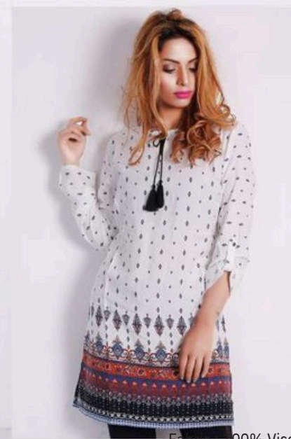
Fabric : 100% Viscose 60 X 60 / 90 X 88 80 GSM