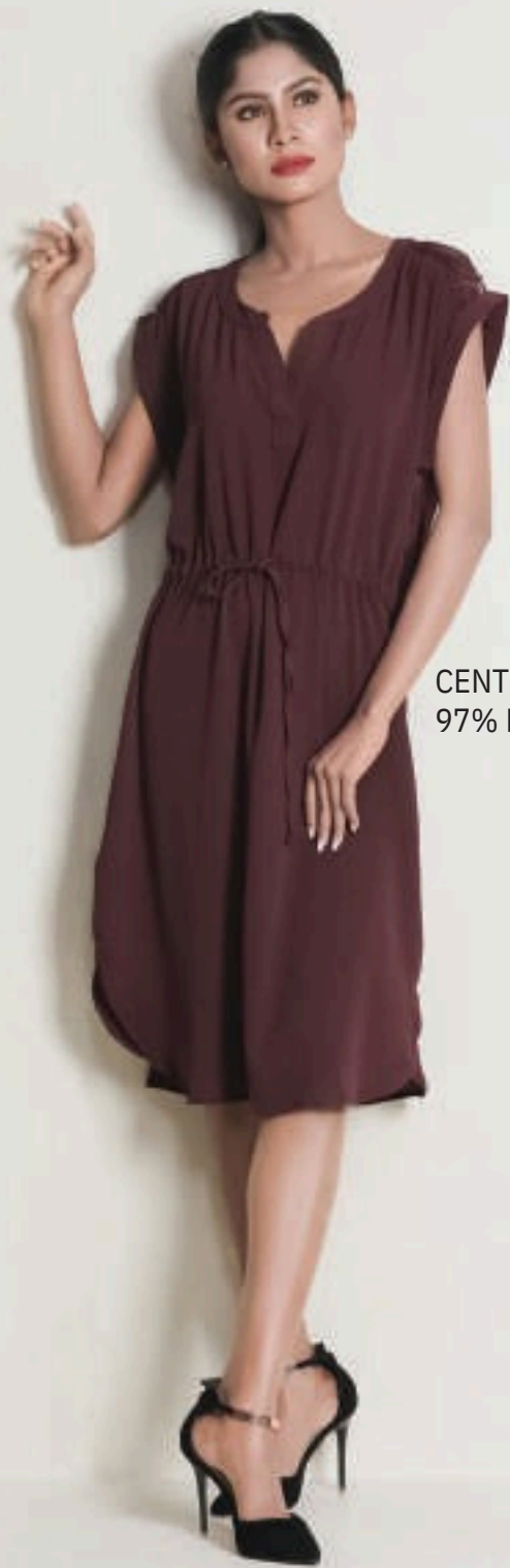
CENTRO 97% POLY 3% SPANDEX