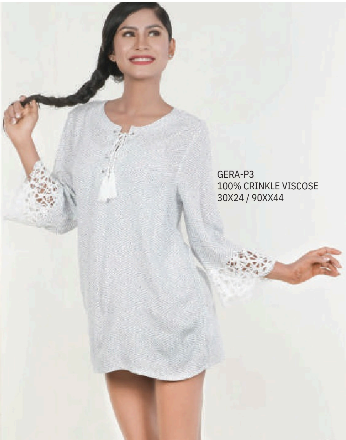
GERA-P3 100% CRINKLE VISCOSE 30X24 / 90XX44