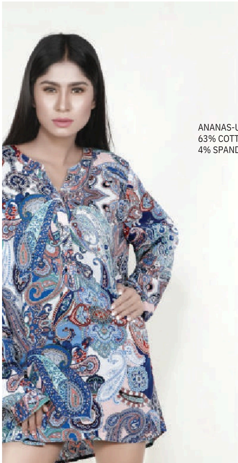
ANANAS-UPT-M3 63% COTTON 33% T 4% SPANDEX