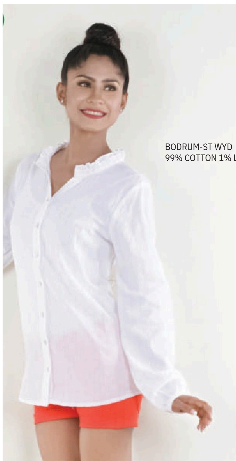
BODRUM-ST WYD 99% COTTON 1% LUREX