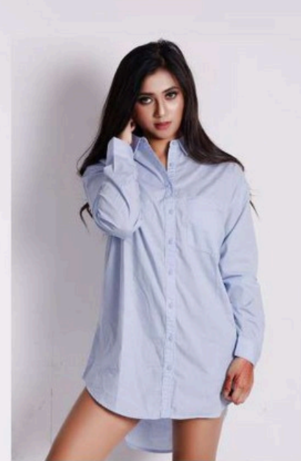
Fabric : 60% Cotton 40% Polyester CVC Poplin 75/80 GSM