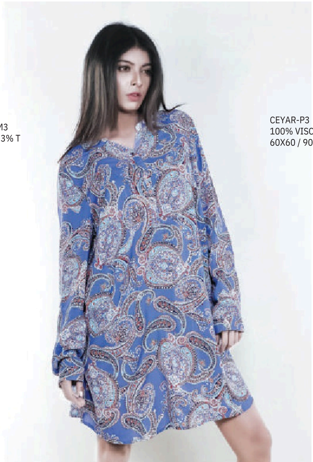
CEYAR-P3 100% VISCOSE VOILE 60X60 / 90X88