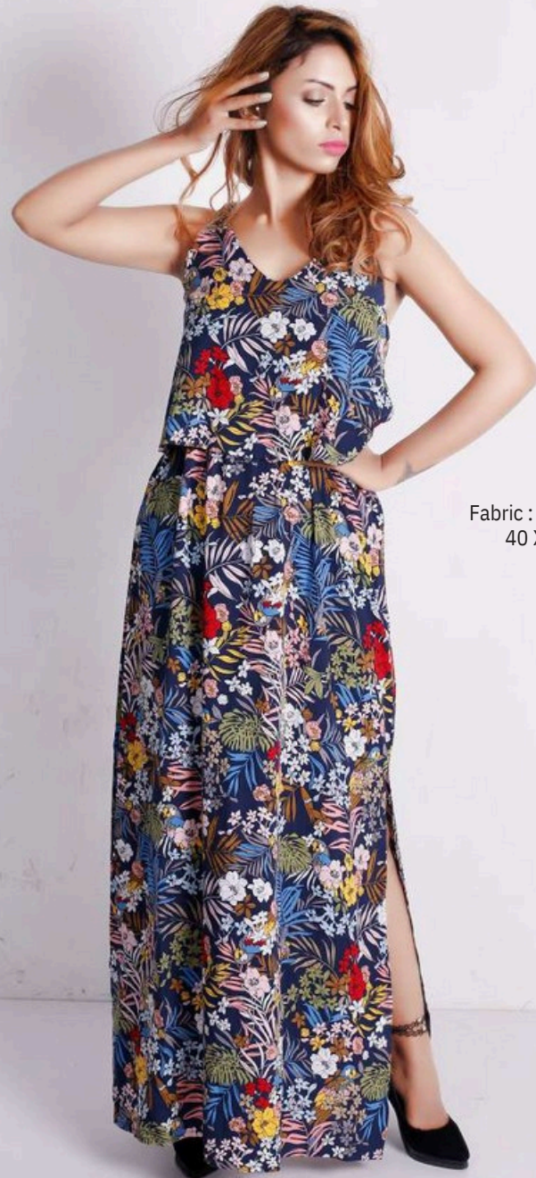
Fabric : 100% Viscose AOP 40 X 40 / 110 X 80 125 GSM