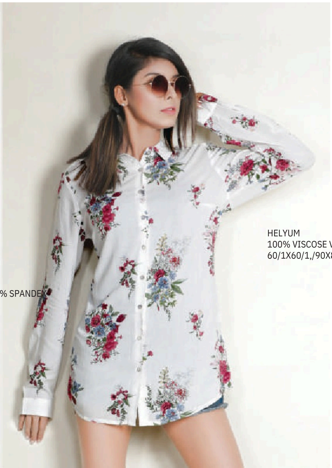
HELYUM 100% VISCOSE VOILE 60/1X60/1,/90X88