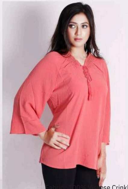
Fabric : 100% Viscose Crinkle 30 X 24 / 68 X 44 135 GSM