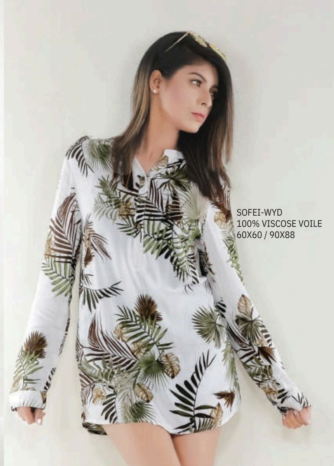
SOFEI-WYD 100% VISCOSE VOILE 60X60 / 90X88