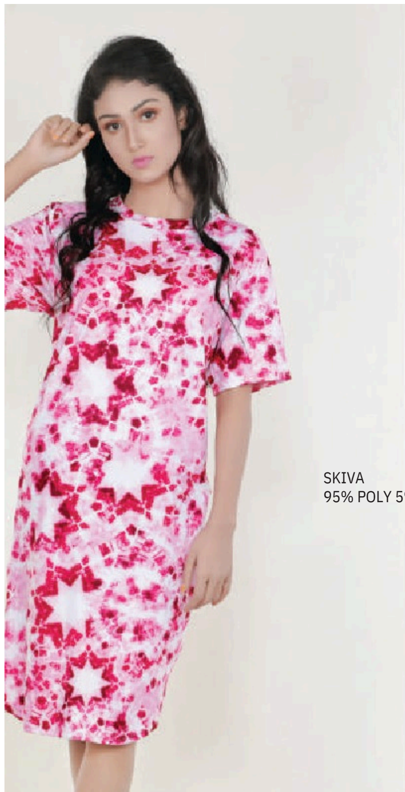
SKIVA 95% POLY 5% SPANDEX