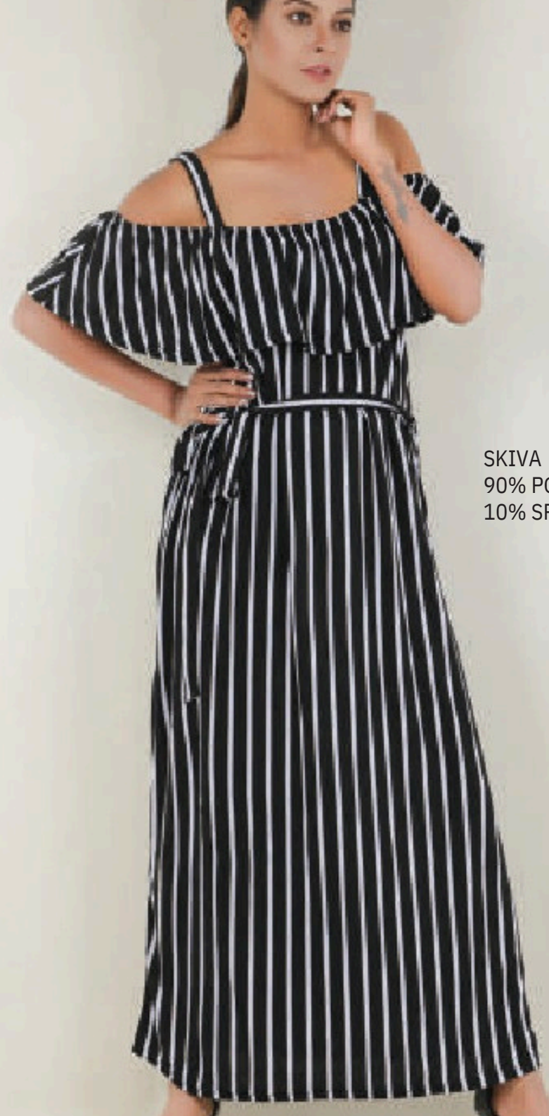
SKIVA 90% POLYESTER 10% SPANDEX