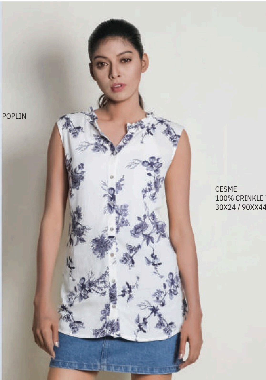
CESME 100% CRINKLE VISCOSE 30X24 / 90XX44