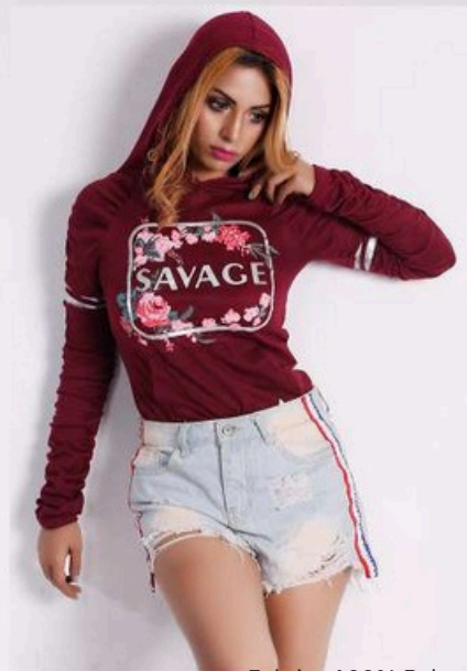
Fabric : 100% Polyester Hatchie Solid 180 GSM