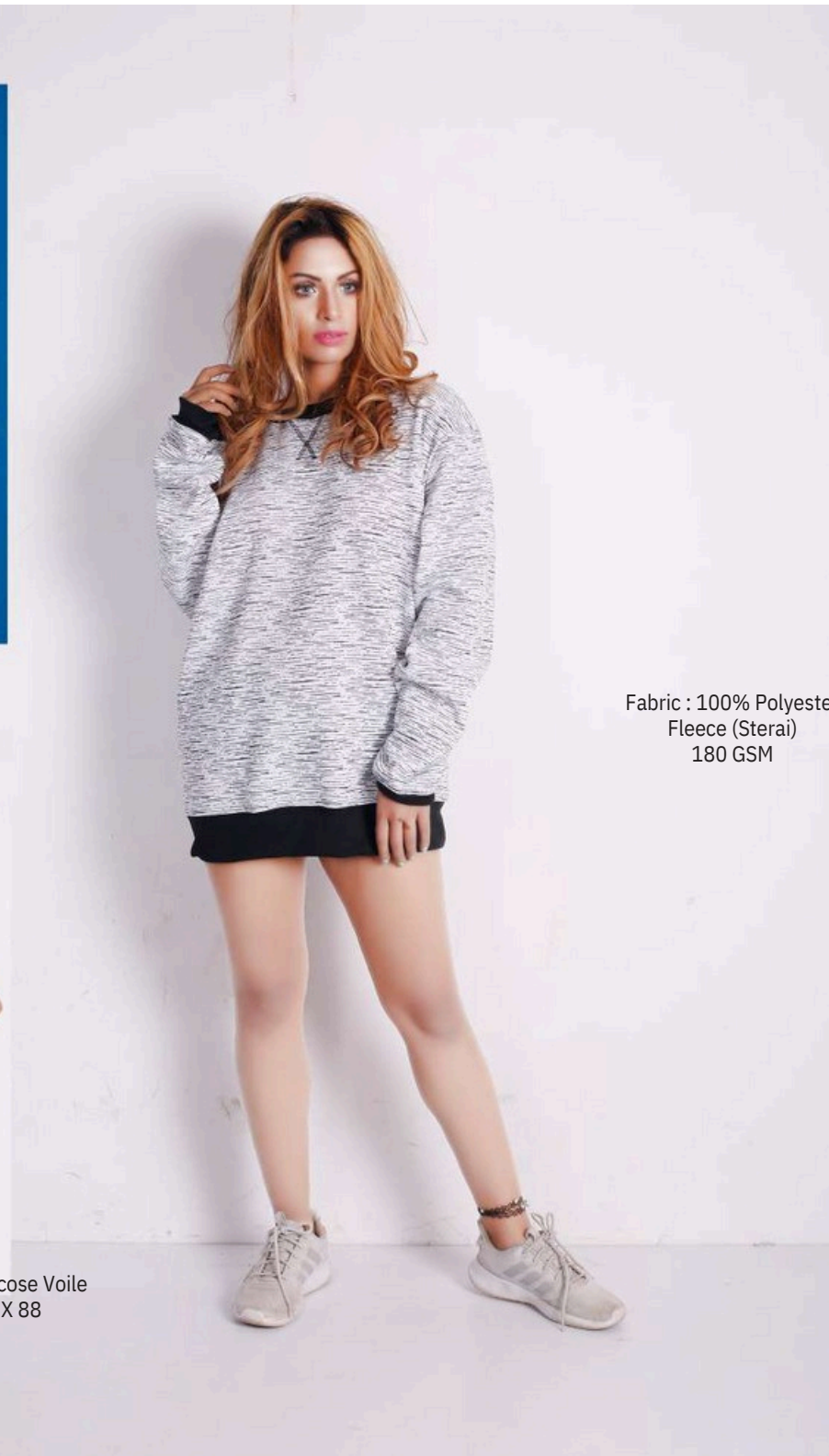
Fabric : 100% Polyester Fleece (Sterai) 180 GSM