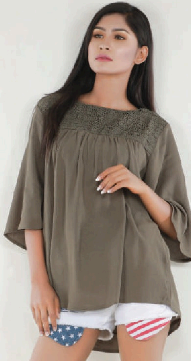
ANGEL 100% CRINKLE VISCOSE 30X24 / 90X44