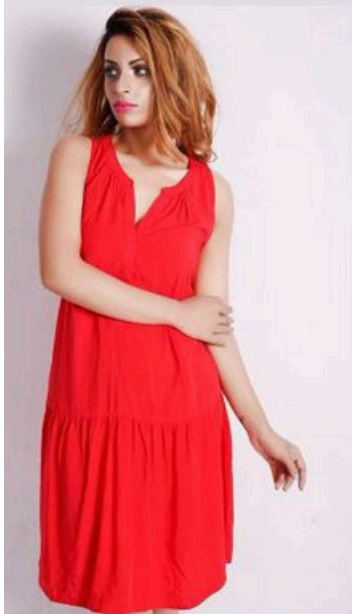
Fabric : 100% Viscose AOP 40 X 40 / 110 X 80 125 GSM