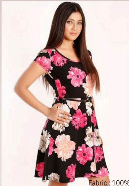
Fabric : 100% Viscose Voile 60 X 60 / 90 X 88 110 GSM