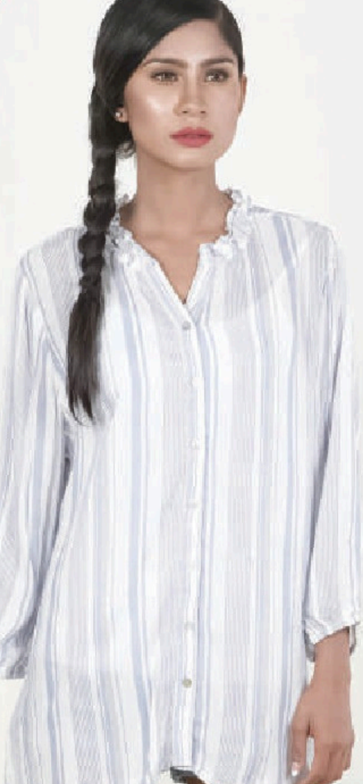
BODRUM-P3 100% VISCOSE VOILE 60X60 / 90X88