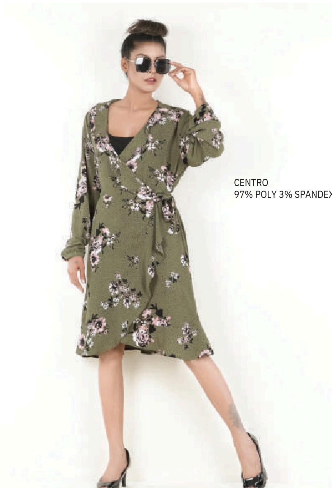
CENTRO 97% POLY 3% SPANDEX