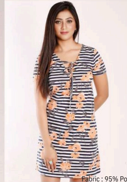
Fabric : 95% Polyester 5% Spandex Spun Spandex 160-170 GSM