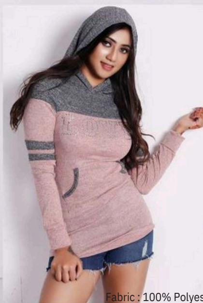
Fabric : 100% Polyester Hatchie Fab 180 GSM