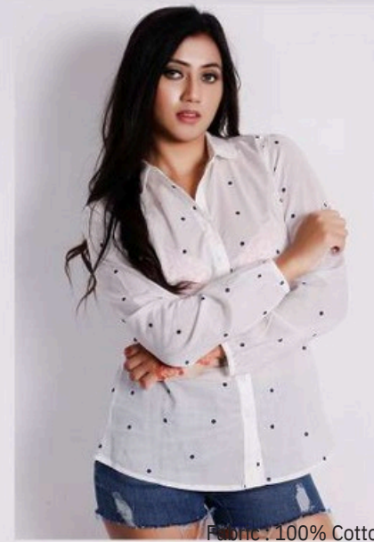
Fabric : 100% Cotton 60 X 60 / 90 X 88 75 GSM