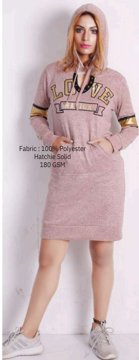
Fabric : 100% Polyester Hatchie Solid 180 GSM