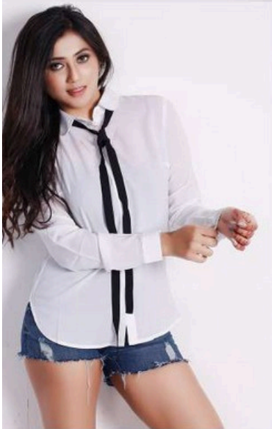
Fabric : 100% Polyester Chi on 60 / 1 X 60 / 1, 90 X 88 100 GSM