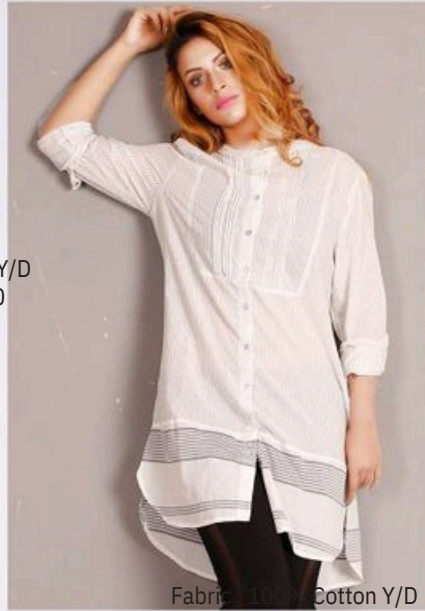
Fabric : 100% Cotton Y/D 60 X 1/ 60 X 1, 90 X 88 85 GSM