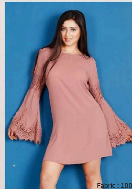
Fabric : 100% Viscose Voile 60 X 60 / 90 X 88 110 GSM