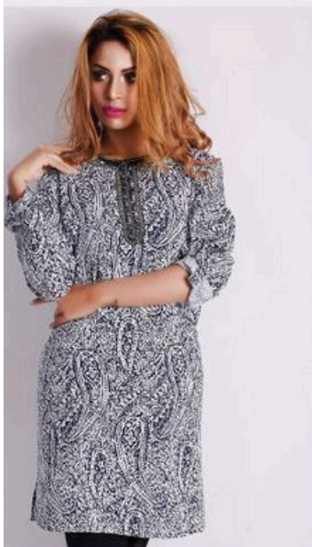
Fabric : 100% Viscose AOP 40 X 40 / 110 X 80 125 GSM