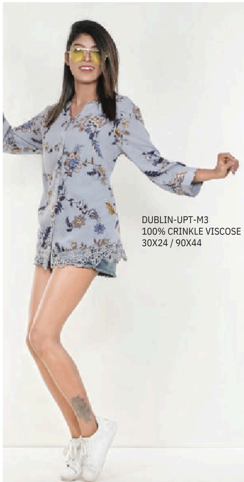
DUBLIN-UPT-M3 100% CRINKLE VISCOSE 30X24 / 90X44