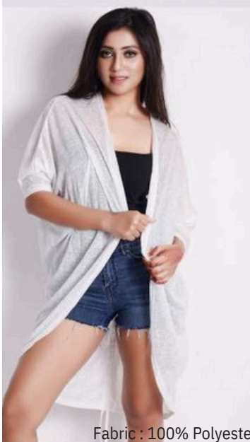
Fabric : 100% Polyester Onion Skinz 120 GSM