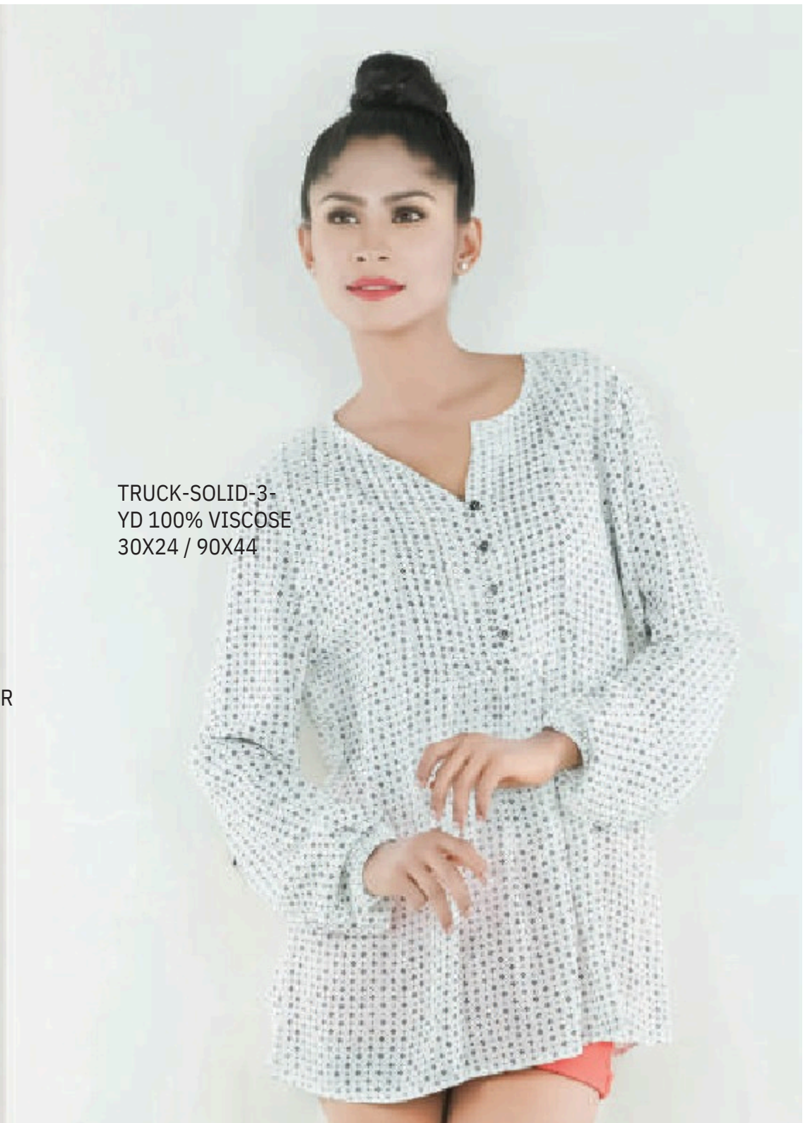
TRUCK-SOLID-3- YD 100% VISCOSE 30X24 / 90X44