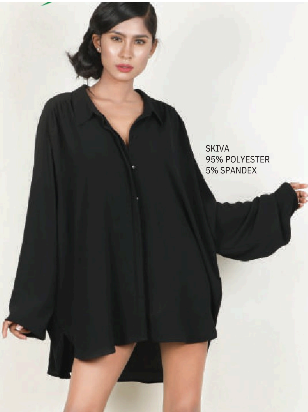
SKIVA 95% POLYESTER 5% SPANDEX