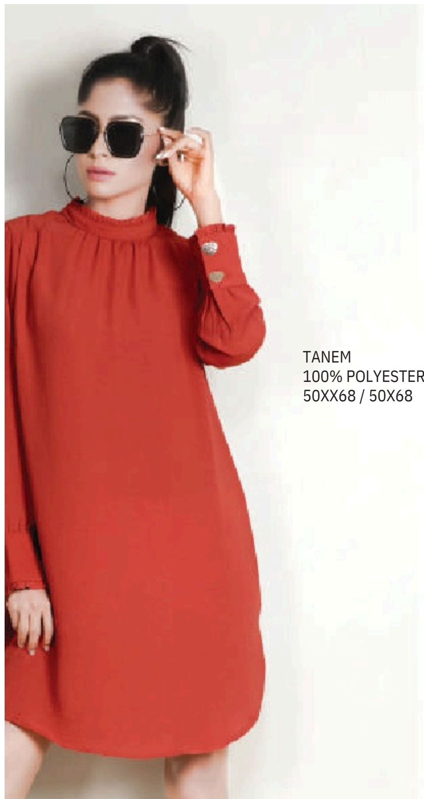
TANEM 100% POLYESTER 50XX68 / 50X68