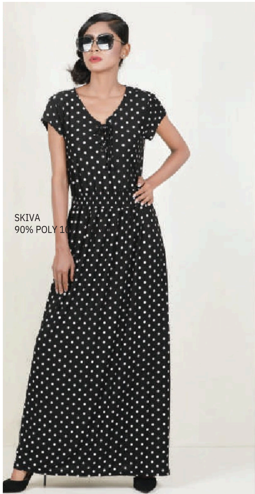
SKIVA 90% POLY 10% SP / 30X24