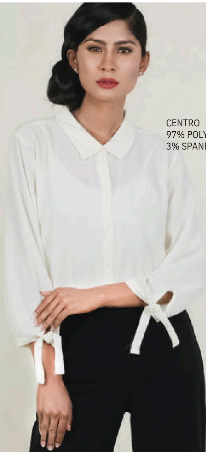
CENTRO 97% POLYESTER 3% SPANDEX