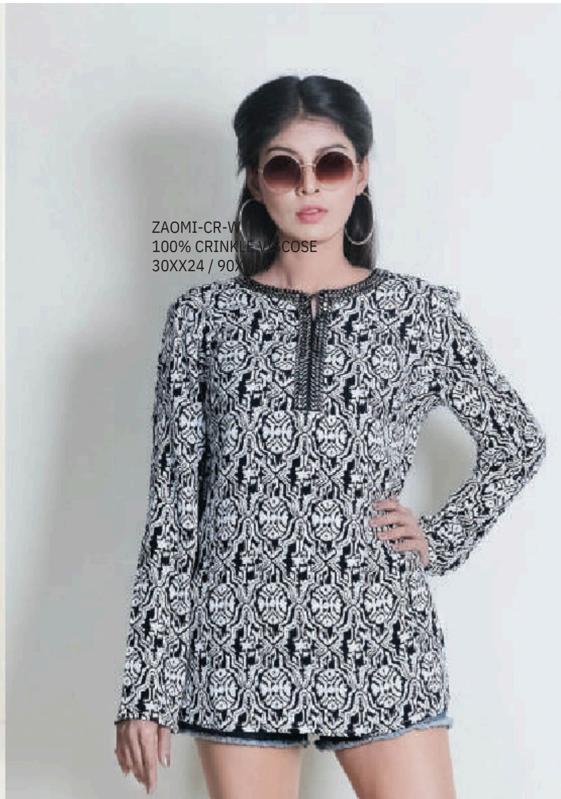
ZAOMI-CR-V 100% CRINKLE V-COSE 30XX24 / 90X