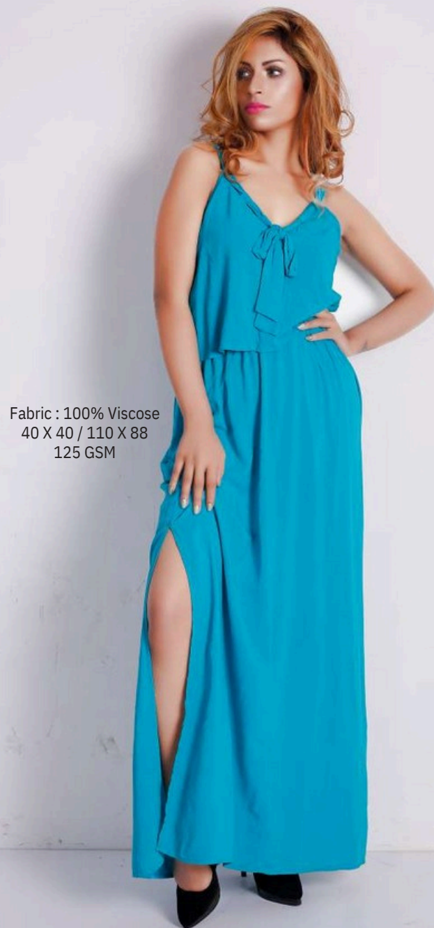
Fabric : 100% Viscose 40 X 40 / 110 X 88 125 GSM