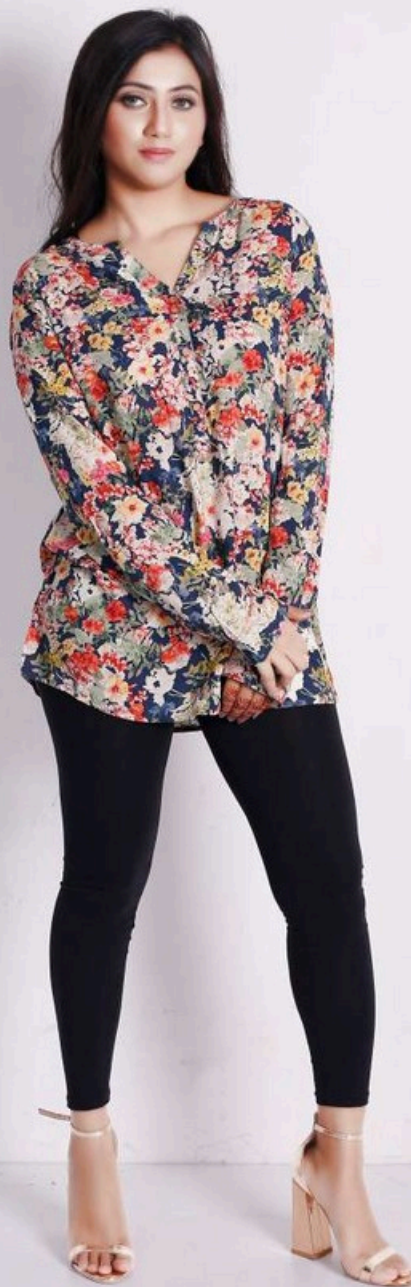
Fabric : 100% Viscose AOP 40 X 40 / 110 X 80 125 GSM