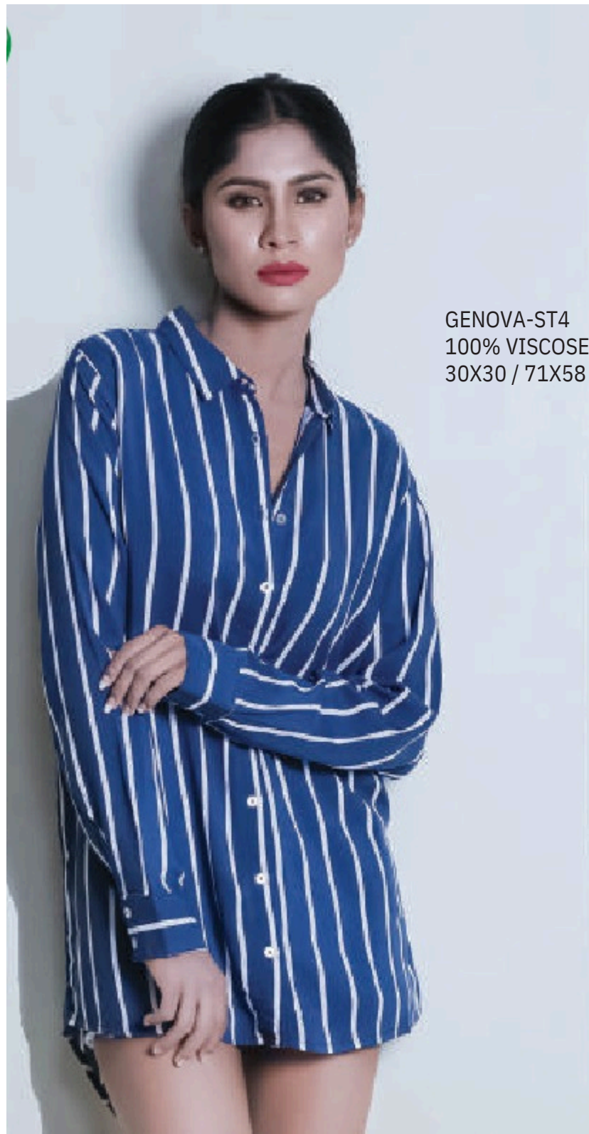
GENOVA-ST4 100% VISCOSE POPLIN 30X30 / 71X58