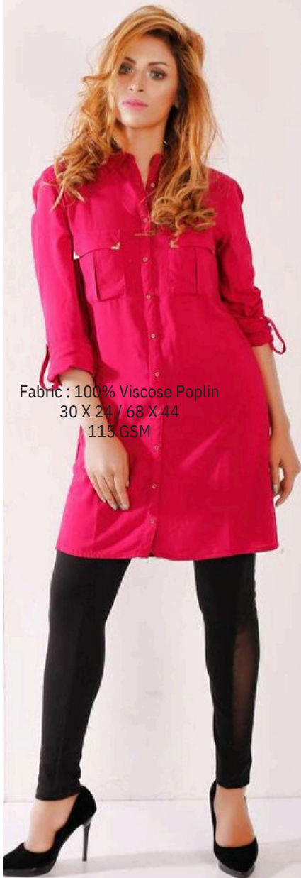
Fabric : 100% Viscose Poplin 30 X 24 / 68 X 44 115 GSM