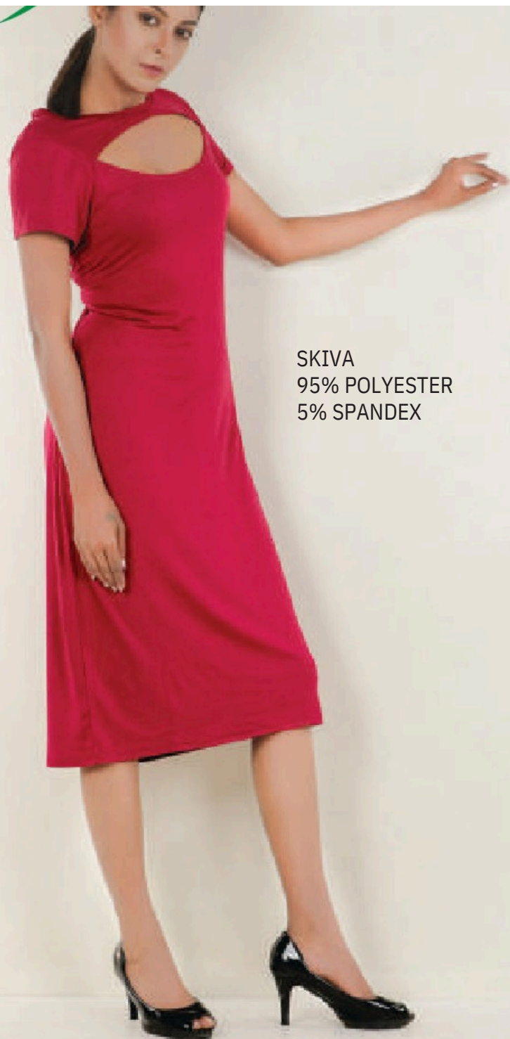
SKIVA 95% POLYESTER 5% SPANDEX