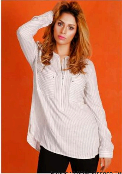
Fabric : 100% Viscose Twill 30 / 1 X 30 / 1, 99 X 68 130 GSM