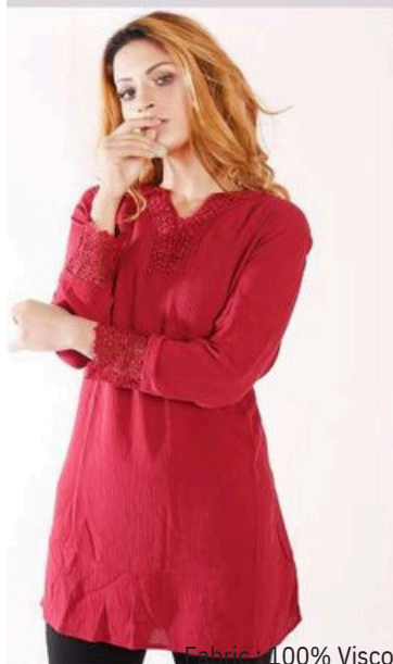
Fabric : 100% Viscose Crepe 30 X 24 / 68 X 44 135 GSM