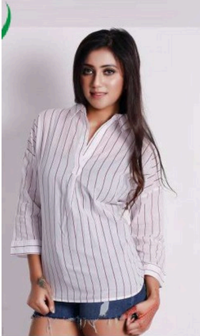
Fabric : 100% Cotton Voile 60 X 60 / 90 X 88 75 GSM