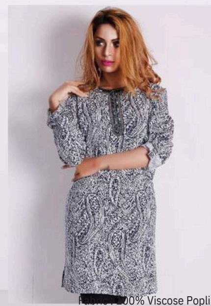
Fabric : 100% Viscose Poplin 30 X 30 / 71 X 58 120 GSM