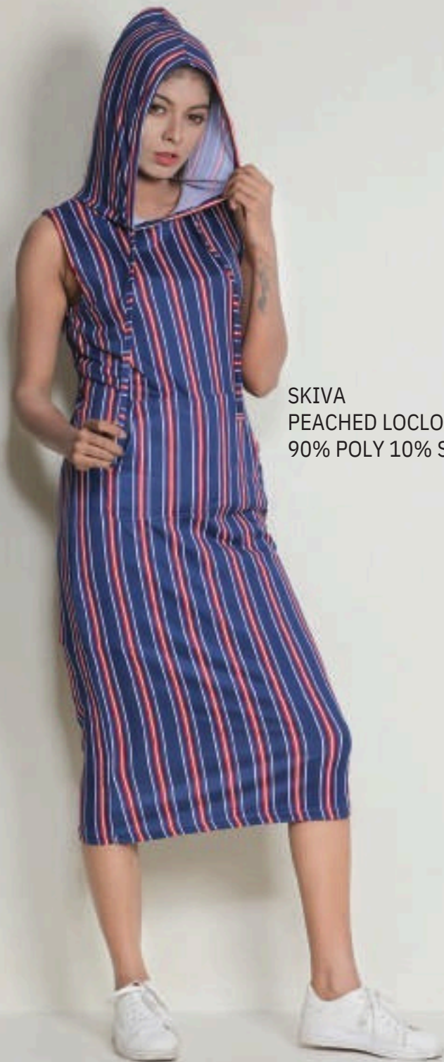
SKIVA PEACHED LOCLOUS AOP 90% POLY 10% SPANDEX