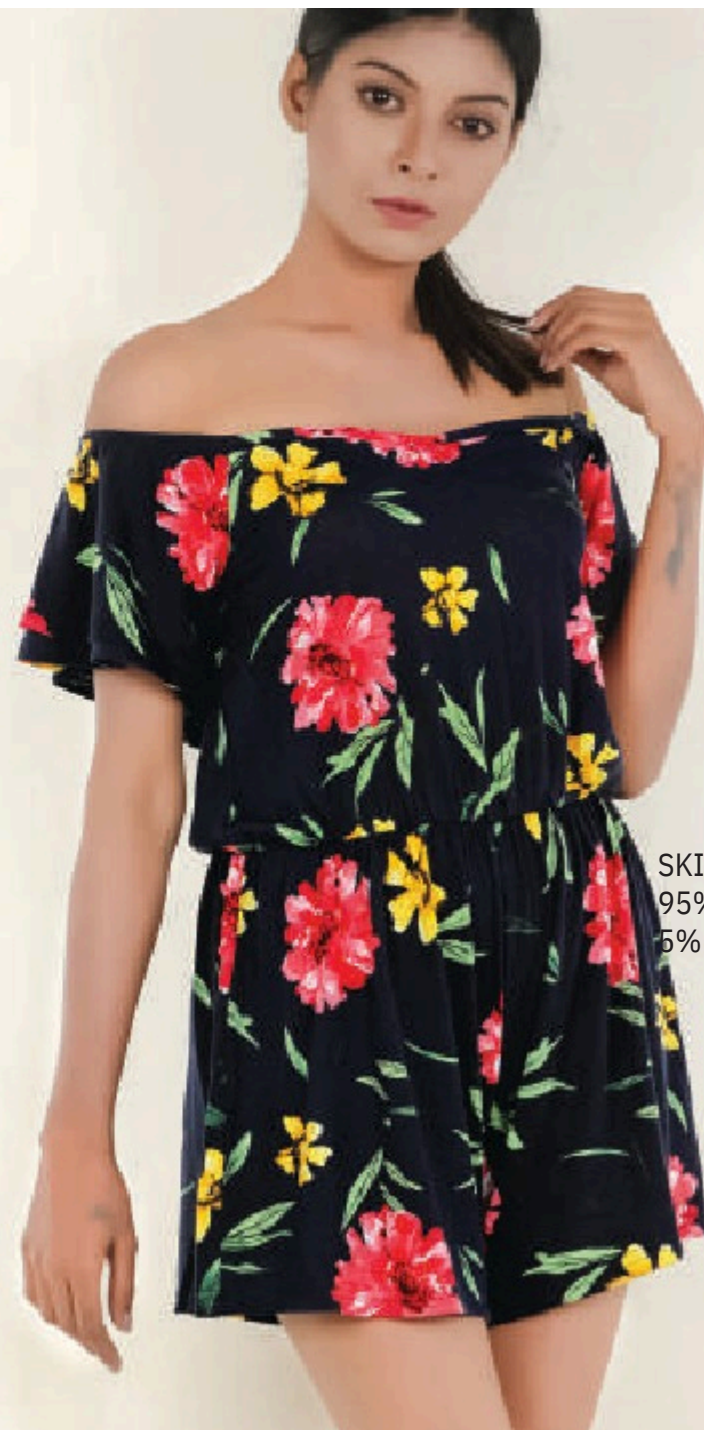
SKIVA 95% POLYESTER 5% SPANDEX