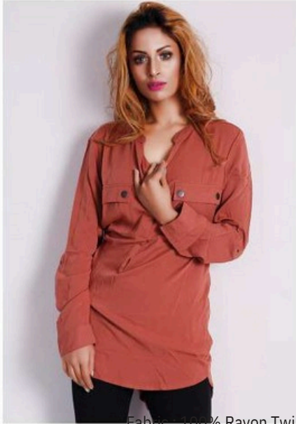
Fabric : 100% Rayon Twill 30 X 30 / 106 X 66 160 GSM