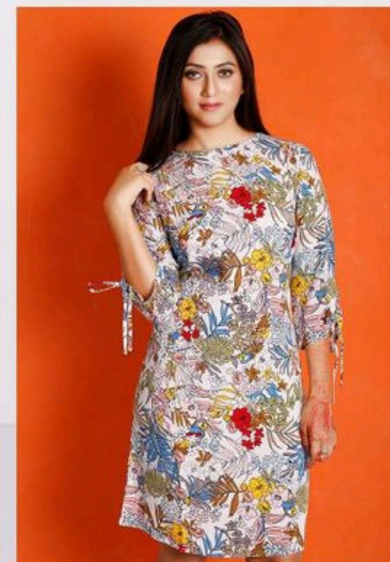
Fabric : 100% Viscose AOP 40 X 40 / 110 X 80 125 GSM